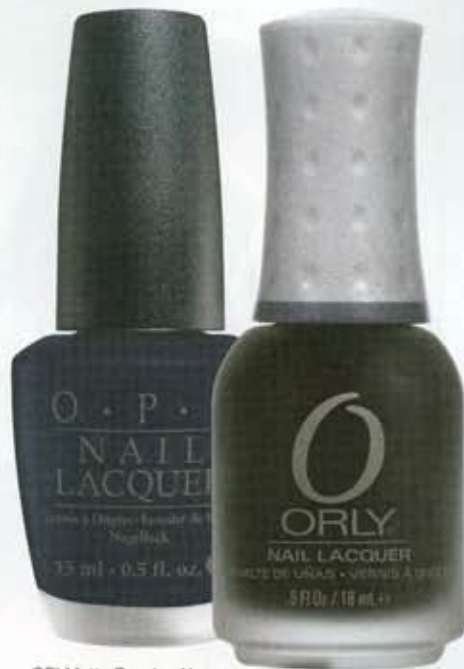
OPI Matte Russian Navy Orly Matte Couture "Vinyf" Black Crème

A: Look for the movie next year! It's a must-see...completely different from Miley's other movies! As far as her hair goes, I was asked to style her for the Teen Choice Awards, for a few photo sessions and for a music video for The Last Song . Miley is the hardest working person—not just teen, but person—I know. I love that girl!